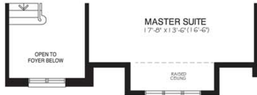
SECOND FLOOR ELEVATION B